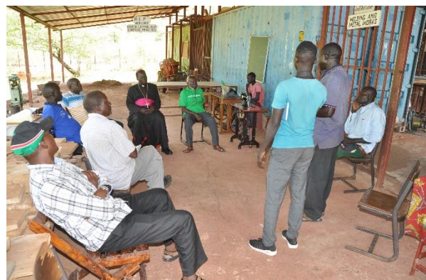
Bishop Stephen is presented to the facilities and program.

The practical training at VTS is ongoing. There is a need for construction of a dormitory for the students/trainees. For 2019 there is a budget for such a building, and the construction work is expected to start soon.