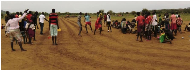
Athletics for the pupils: 4 x 400m

The number of school children in 2019 is the highest ever at St Thomas primary school; 428 registered for first term.