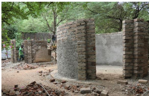
Rehabilitation of the two tukuls

During the last months strong wind blew off the roof of the building made for maternity ward