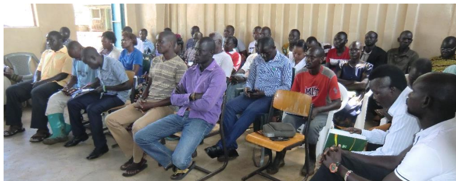
All staff meeting 3 rd June in HTPVK

The input by NCA/EU project to the management through funding and competence is significant.