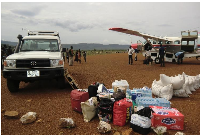
Departure of the Board, arrival of supplies

There is a need to work more on the budget and activity plan. The distribution of funds is not quite corresponding with the planned activities and expenses.