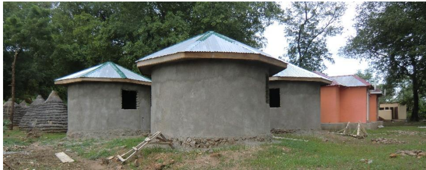
The new houses under construction at Peace Academy

The construction of buildings for Peace Academy is almost completed, however, there are needs to fulfil some of the work. Three new houses, - round ones, are constructed this year and almost completed in beginning of June. Electric power at Peace Academy must be provided from generator. Beds with mattresses are now installed in the self-contained houses.