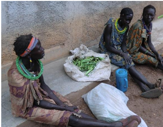
A woman is bringing her crop of Okra for sale to Kuron Guesthouse. Okra is not traditionally cultivated in this area

It is now possible to observe some small signs of change of culture in the area. Sale of goats and sheep has increased, and some few people have brought “cashcrops” for sale.