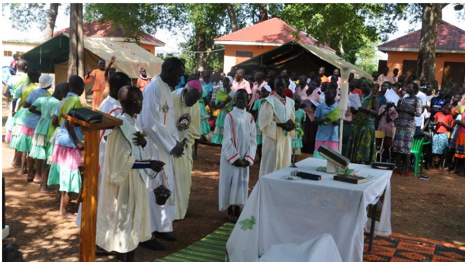
Sunday Mass 9 th June at Peace Academy

In Kuron Chapel there are Mass on Mondays, Wednesdays, Thursdays and Fridays at 1700, and Saturdays at 0730. Tuesday there is Mass at the school at 0800, Sundays normally at the school at 1000, however, sometimes Sunday Mass is celebrated at Peace Academy.