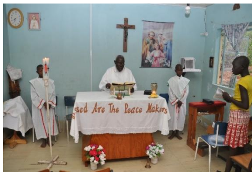
Mass at Kuron Chapel

In Kuron Chapel there are Mass on Mondays, Wednesdays, Thursdays and Fridays at 1700, and Saturdays at 0730. Tuesday there is Mass at the school at 0800, Sundays normally at the school at 1000, however, sometimes Sunday Mass is celebrated at Peace Academy.