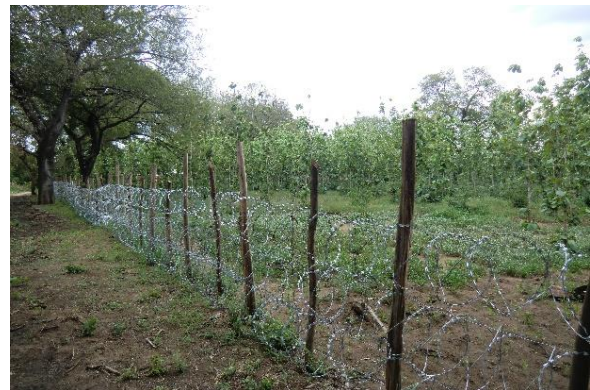
The fenced farm area near Peace Academy

The cultivation at the area near Peace Academy is ongoing. The bananas dried up during dry season even when watered. At present new banana-sprouts are growing well. The cultivated area is now well fenced. Various crops are grown and sold to Kuron Guesthouse and staff. Seedlings of Teak is ready to be planted out.