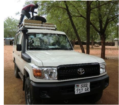
The new Landcruiser, here transporting board members and staff from the airstrip in Kuron

A new Landcruiser was donated to Peace Village by MIVA and arrived in HTPVK in May 2019, - an important input which was very much welcomed.