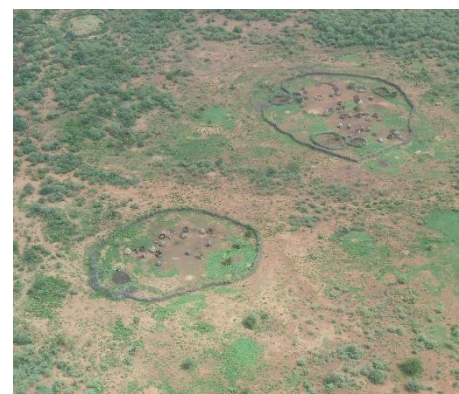
Toposa villages not far from Kuron airstrip