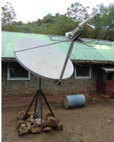
The new disk for Internet, located behind the office

An important improvement early 2019 is the upgrading of the internet capacity. This now allows good and efficient wireless access to Internet whenever there is electricity. Still there might be observed challenges as the number of users, especially on smartphones might overload the system. The access is controlled by password.