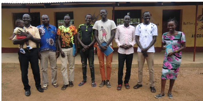
The 4 recruited trainees – in the middle – their trainers (teachers) on the flanks

HTPVK plan to start teaching from first term 2020. Planning has started for the construction, and 4 local young men speaking Toposa, having partly secondary education will be trained to start the education. They are already recruited, and training have started.