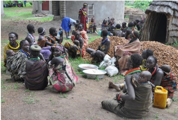
Food for the participants at the community meeting; Men and women from the villages and HTPVK staff

Peace Academy as a location for conferences and workshops are now established. In the period 1 st – 5 th June a group of 29 persons, organised by the INGO Humanity United came to Peace Village for a workshop. They were accommodated at Peace Academy where services were provided by HTPVK: Accommodation, food, electricity 24 hours, and access to internet in the compound. Flights in was provided through HTPVK, in-transport: MAF, (Caravan) and out-transport: Samaritan Purse (DC 3).