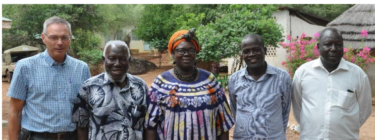
Board of Peace Village, Kuron, June 2019

The Board of Holy Trinity Peace Village, Kuron, June 2019: