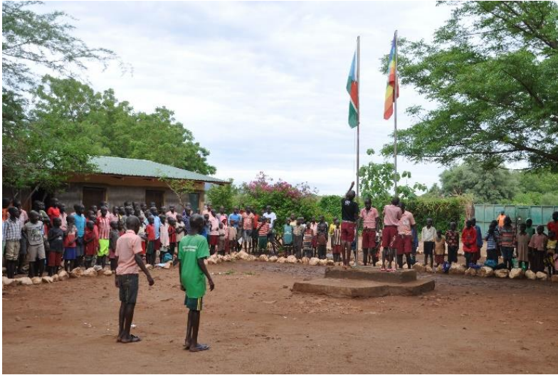
From the morning parade at St Thomas

The school has every day a parade in the mornings at 0730. This ceremony includes flying the flag, singing the national hymn and prayers.