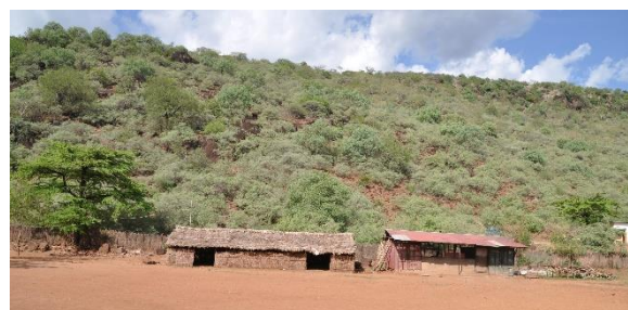
Dining shed (left) and kitchen

During the last months a dining shed is made in St. Thomas School. This is built mainly from local materials.