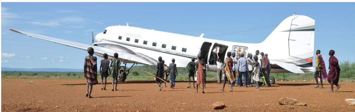
DC 3 is boarding at Kuron airstrip by 29 participants attending Humanity United workshop in Kuron

Peace Academy as a location for conferences and workshops are now established. In the period 1 st – 5 th June a group of 29 persons, organised by the INGO Humanity United came to Peace Village for a workshop. They were accommodated at Peace Academy where services were provided by HTPVK: Accommodation, food, electricity 24 hours, and access to internet in the compound. Flights in was provided through HTPVK, in-transport: MAF, (Caravan) and out-transport: Samaritan Purse (DC 3).